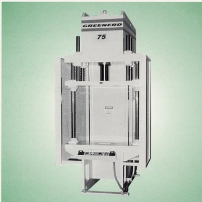
75-Ton C-Frame Press with superior ram guiding and operator safety guards