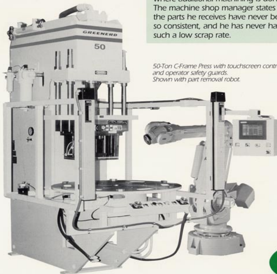
50-Ton C-Frame Press with touchscreen control and operator safety guards. Shown with part removal robot.

Hand finishing is among the highest turnover jobs in most foundries. By making the job of trimming easier, Greenerd trim presses and systems can reduce employee turnover, as well as hiring, training, and unemployment costs.