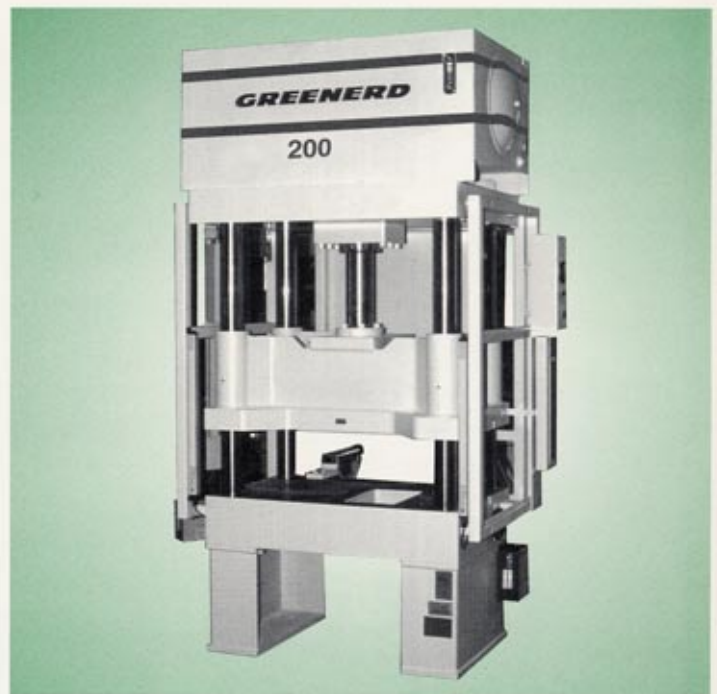
200-Ton 4-Post Press with heavy ram guiding and operator safety guards

For additional information, applications assistance, or a quote, call today: